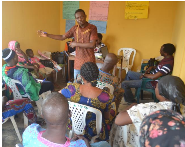
Ogun workshop with Community Drug Distributors

Community mobilisation was reported to be particularly challenging in the areas where there were no rural community structures, or where there were difficulties in access due to challenging geography or security issues.