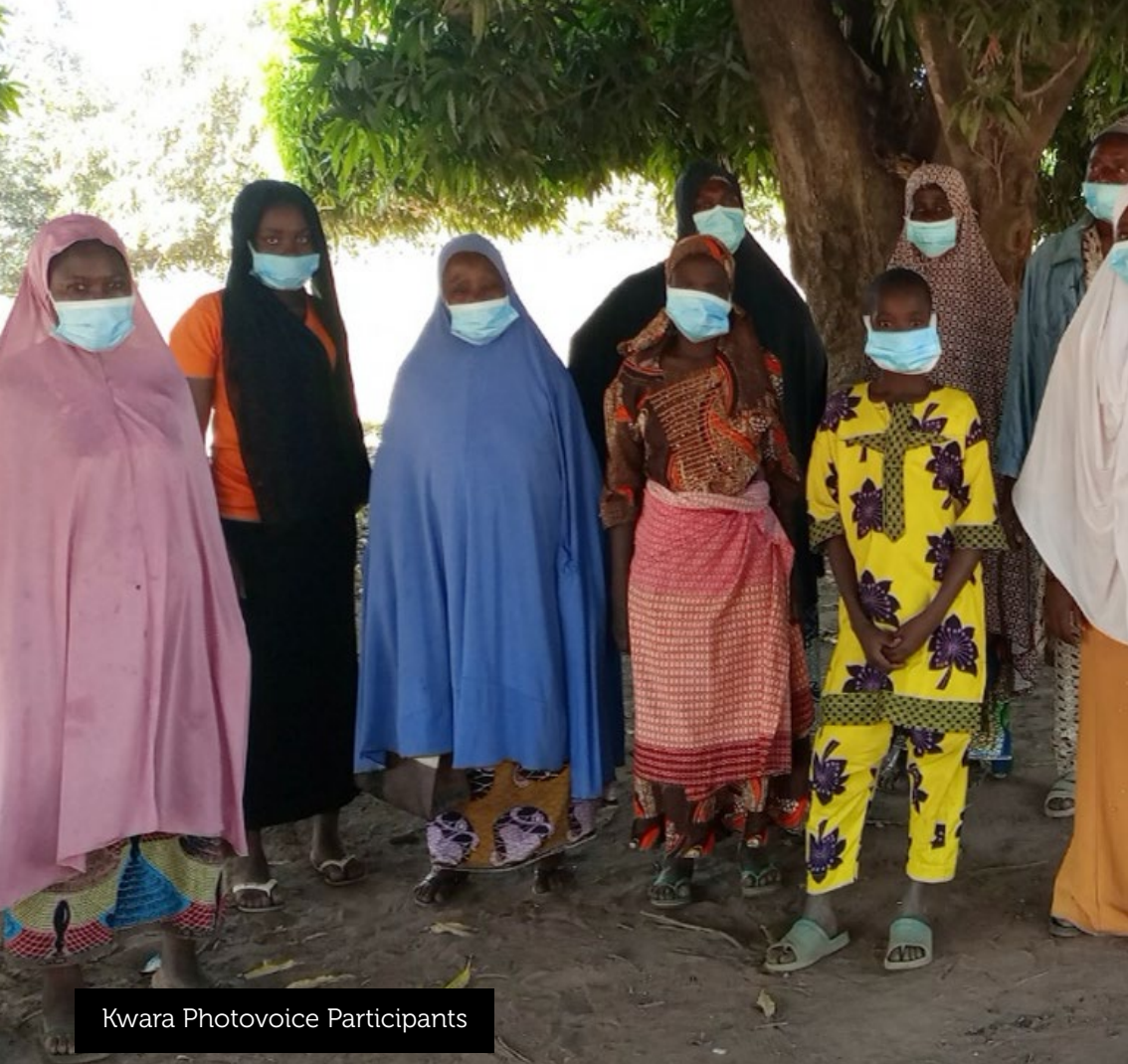
Kwara Photovoice Participants