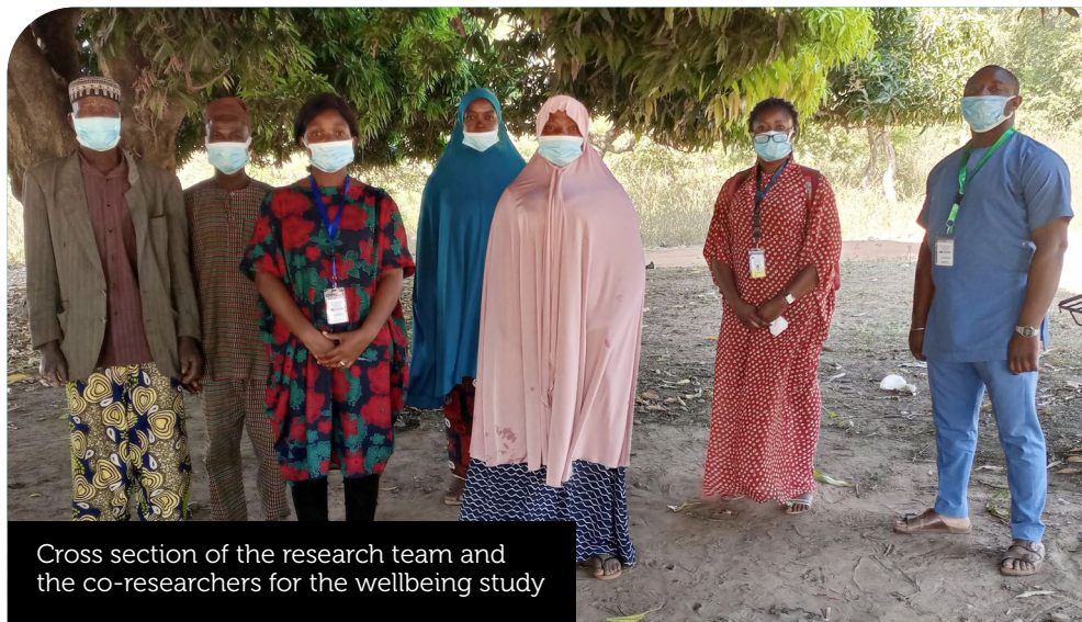
Cross section of the research team and the co-researchers for the wellbeing study

'The pictures help me to showcase my problem and challenge in life, the picture shows I need help. It has really help me to be able to tell the world my problem that I have been keeping to myself.'