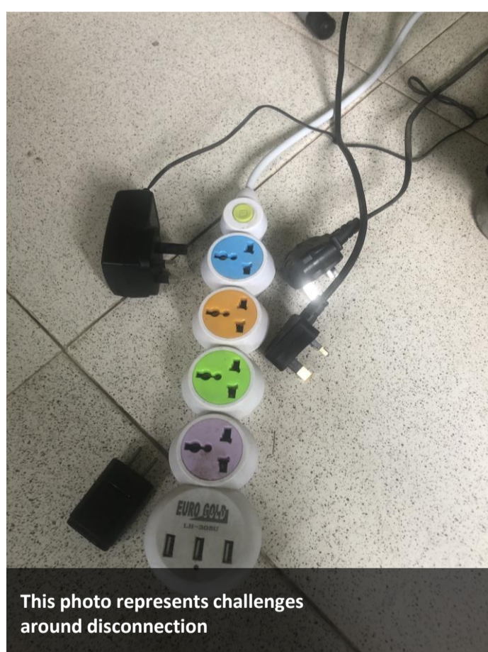
This photo represents challenges around disconnection

"The facilities are there but there is no-one to utilize them"