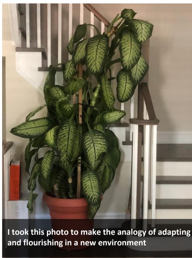
I took this photo to make the analogy of adapting and flourishing in a new environment

"These measures...are gradually leading us to evolve and adapt"